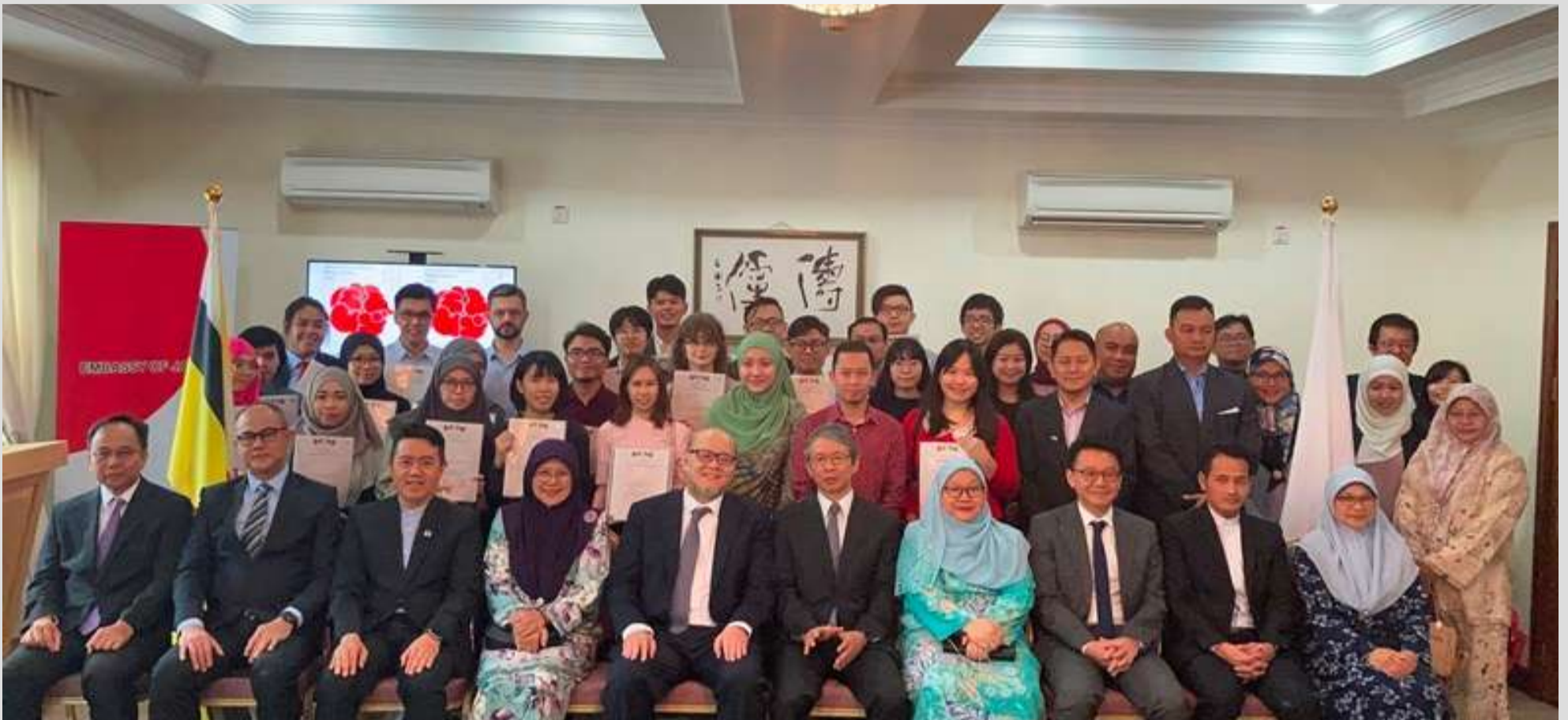
Group photo at the JLPT Certificate Presentation Ceremony with YB Dato Seri Setia Awg Hj Hamzah, Minister of Education, and His Excellency Yamamoto Eiji, Ambassador of Japan to Brunei Darussalam.

日本語能力試験2021認定書授与式が日本大使館で開催され、合格した21人の受験者に認定書が授与された。