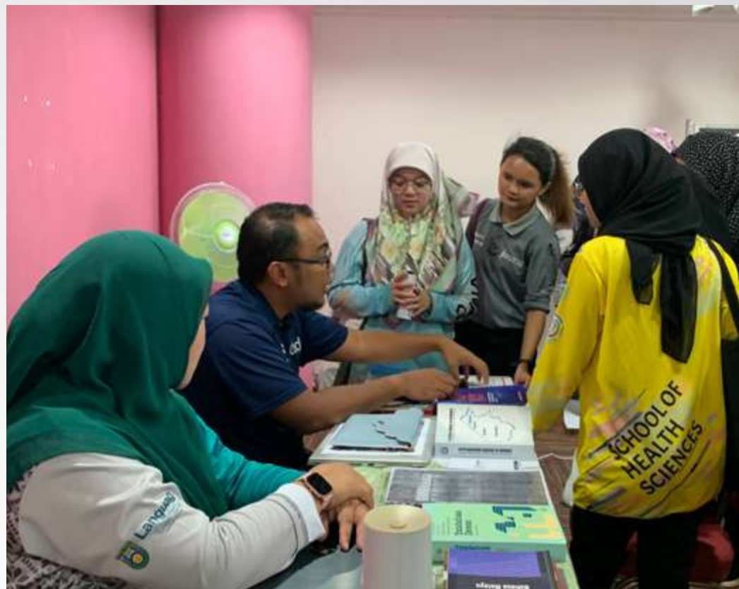
Students visiting a booth at the LC mini open day

The Language Centre held a two-day Mini Open Day for UBD students on 28th and 29th July 2021 to promote language modules offered at the faculty. Held during Freshers Week, the LC Open Day was also part of the campus tour for new students which was supported by PMUBD (Persatuan Mahasiswa-Mahasiswi UBD). The event saw a huge turnout on the first day, with over 600 students visiting various booths to learn more about the language modules at LC. There were seven booths altogether for all language modules currently offered at LC: Arabic, Korean, German, Japanese, English Language and Communication Skills (ELCS), Mandarin, Malay and Dusun. The students had the opportunity to speak with the lecturers about the modules and participate in interactive activities and games prepared at each booth. In addition, two Instagram contests were held as part of the event: 1) #Hashtag and Win, which required students to take a photo of themselves visiting the Mini Open Day, to post on Instagram, as well as tag @LC.UBD with the hashtag #speakgrow; and 2) Follow, Tag and Win in which Instagram users were asked to follow and tag three of their friends in the comments section.