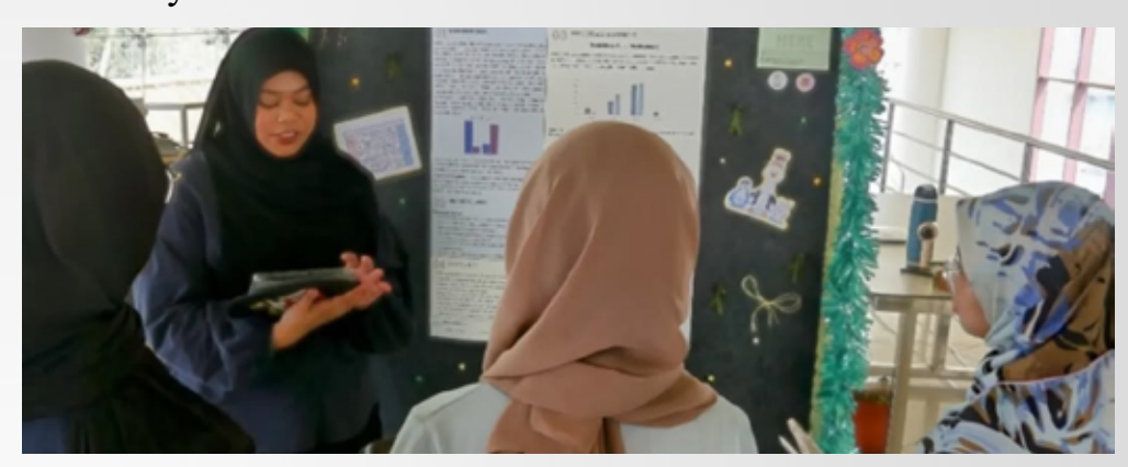
A student presenting her group's poster

Over 300 students worked in groups to present their research Academic Report Writing and Oral Presentation Skills hosted a findings, presenting their ideas in the form of a poster they designed. public showcase for students' poster presentations as part of their Among other criteria, students were assessed on their ability to relay their ideas clearly and professionally while working effectively as a team. Additionally, based on votes, two student groups also ultimately won the Best Research Poster Award.