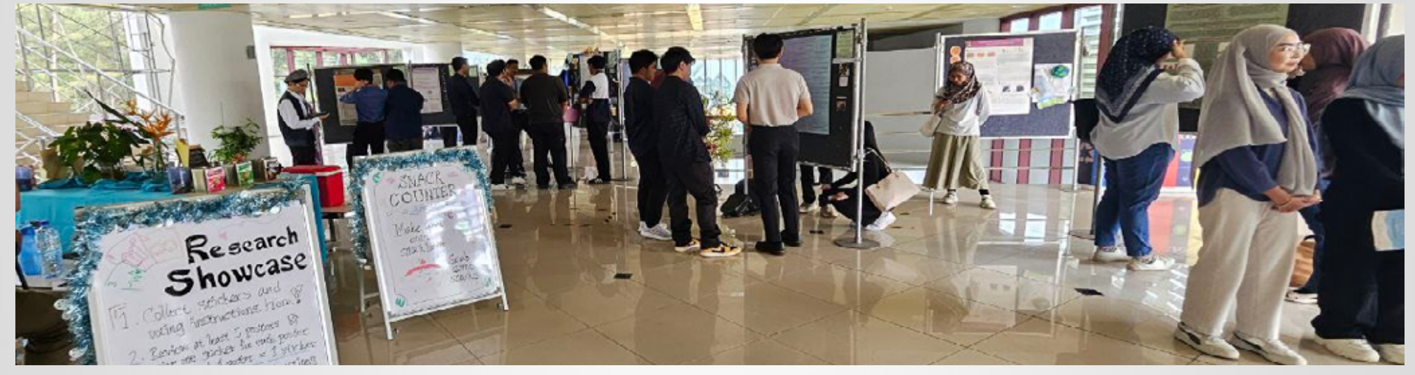
Students preparing to present